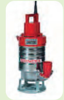
Mud pump Salvador