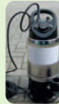
mud pump Solid

Naturally, the pumps are fully submersible, and delivered ready for use, complete with cable and plug.