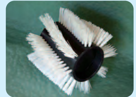
LINN brush wheel