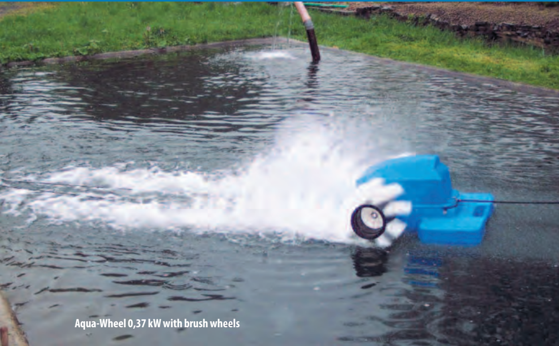
Aqua-Wheel 0,37 kW with brush wheels